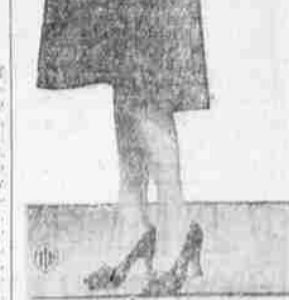
One of the newer afternoon dresses showing rest Abnorm lace collar and the neat, diamond-shaped shirring at front, back and sides and flared skirt give it the stamp of up-to-date fashion. An "Arnes" model turban of the same satin is worn with the dress.