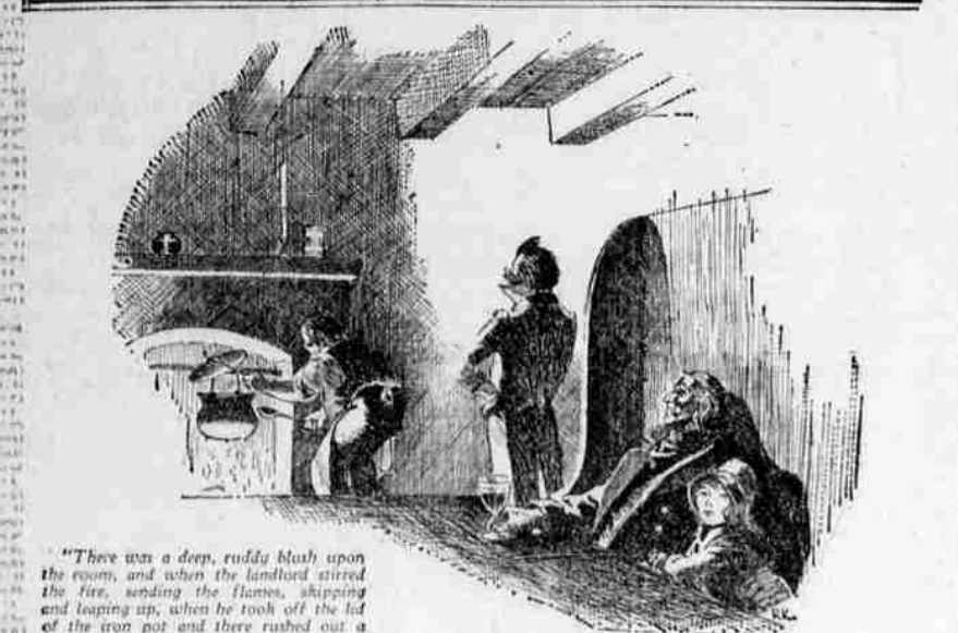
"There was a deep, ruddy blush upon the cheek, and when the landlord stirred the fire, sending the flames, shipping and leaping up, when he took off the lid of the iron pot and there rushed out a savory smell, while the bubbling sound grew deeper and more rich and an unobtrusive steam came floating out, hanging in a delicious mist about their heads... when he did this Mr. Codlin's heart was touched." —OLD CURIOSITY SHOP.