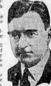
DR. ROYAL S. COPELAND, M.D.

The causes of eye pain are many. Perhaps the most common is eye strain. This may be due to the excessive use of a pair of normal eyes, or it may come from the need of glasses.