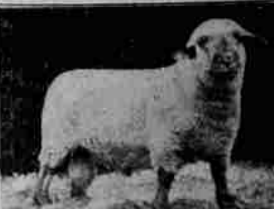
Imported Ram No. 15849 Head of Our Herd