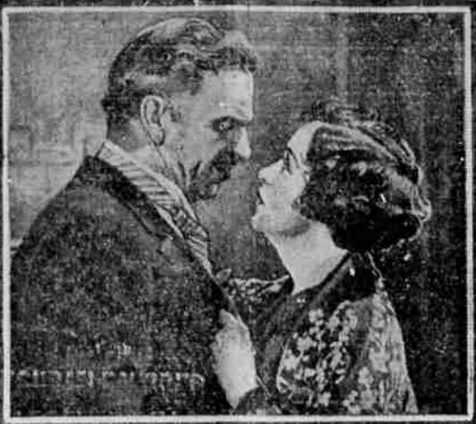
Wallace Beery and Florence Vidor in "Chinatown Nights" a Paramount Picture based on the story "Tong War"

There is more mystery in one Chinese standing in a shadowy Chinatown doorway than in all the mystery stories ever written. And in "Chinatown Nights," which opens at 3 day run at the Antlers today there are more than five hundred Chinese revealed in all the intriguing and little known business of their powerful towns. "Chinatown Nights" is a picture for everyone who loves drama, excitement and mystery. The suspense and action of the picture are excellently handled and the revelation of the inscrutable practices of Chinese long-life are surprising. A superior cast of screen artists enact this superb drama. Wallace Beery, Florence Vidor, Warner Oland and Jack Ockie head the cast of noted screen players. The picture was directed by William A. Wellman, the man who made "Wings."