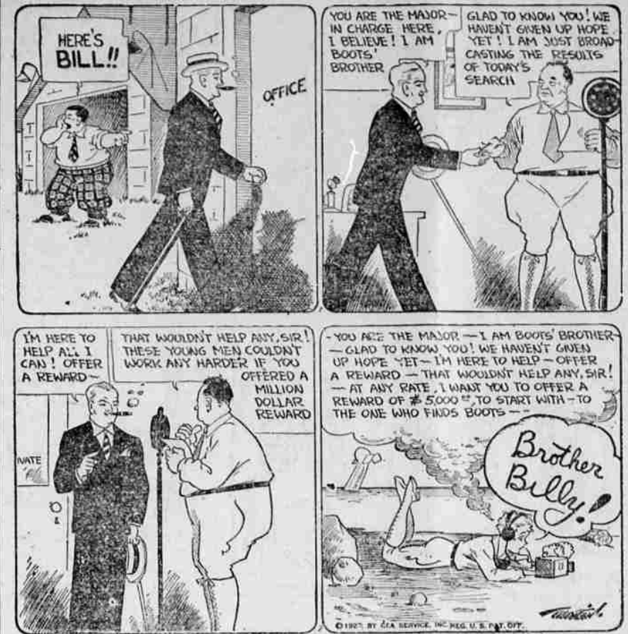
If Boots Could Only Tell Them