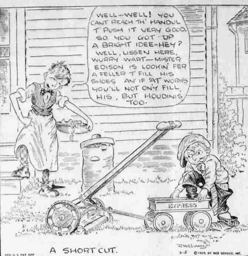
A SHORT CUT.