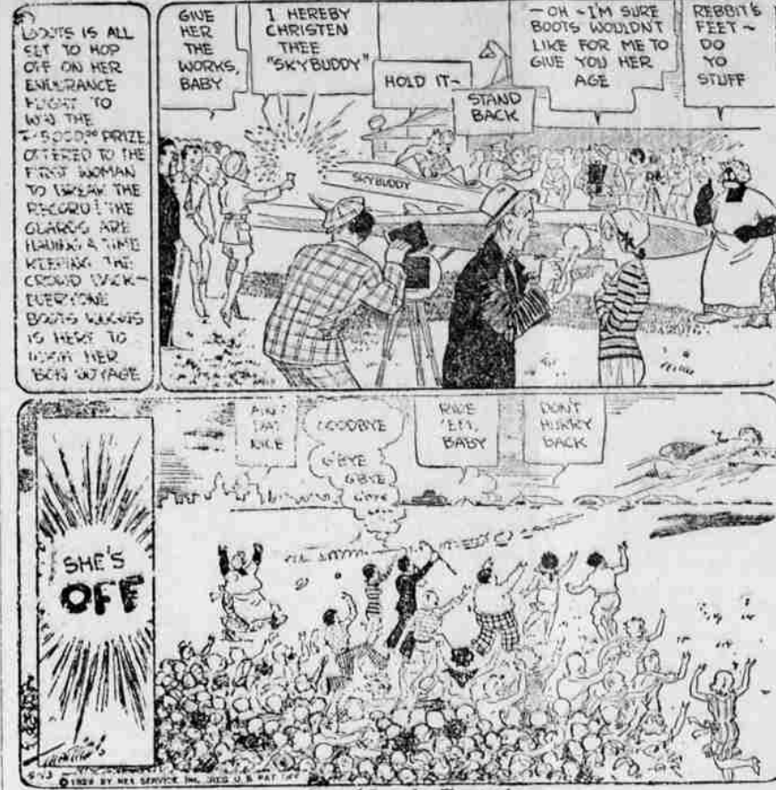
Good Luck, Boots!