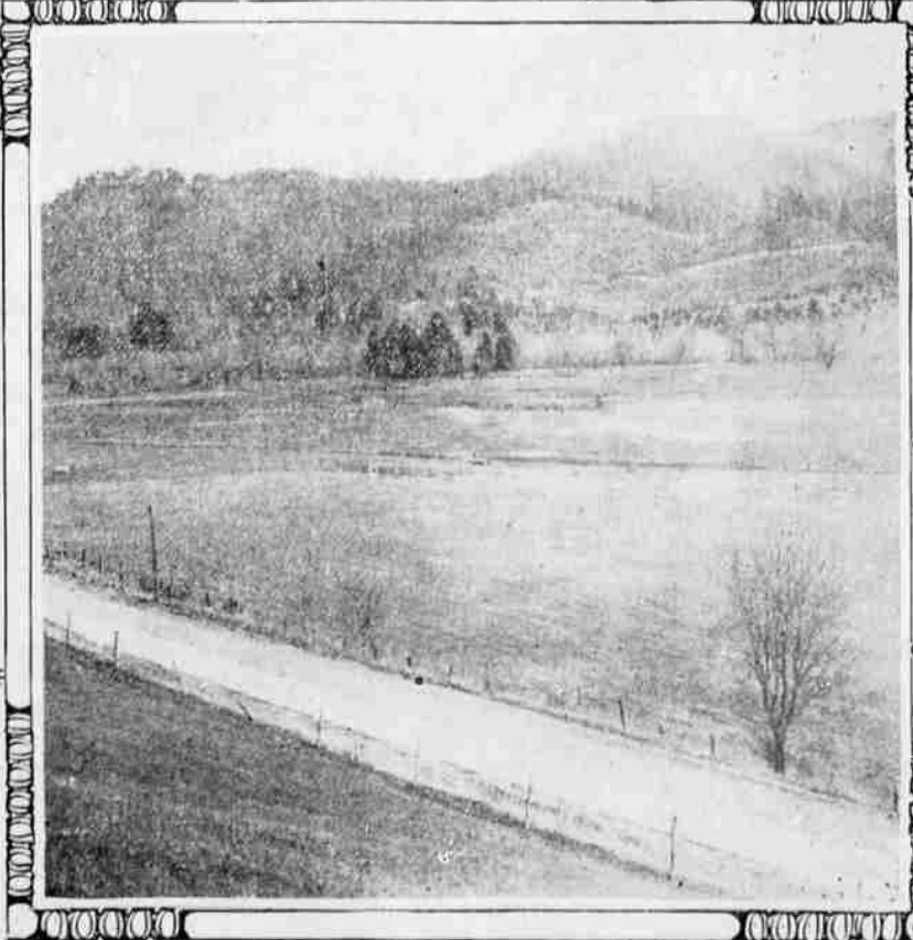
Top, General View of Glendale Lumber Company Plant, Giving an Idea of its Extent and Size—Middle, View Showing Interior of Great Mill—Bottom, Left, Scene on Pacific Highway Near Glendale—Right, Close up View of Great Mill Just Completed.