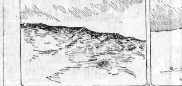
SOMEWHERE OVER THE DEEP BROAD PACIFIC IS THE AMPHIBIAN PLANE THAT CARRIES FRECKLES AND HIS UNCLE HARRY TO OVERTAKE THE BOAT BOUND FOR HAWAII.....