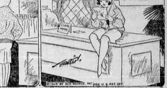
SHE WAS READIN' THIS LETTER WHEN—WELL, WHAT DO YA KNOW ABOUT THIS? HOT DARN!! GOOD FOR TH' LITTLE GIRL—GEE, I'M GLAD!!!!