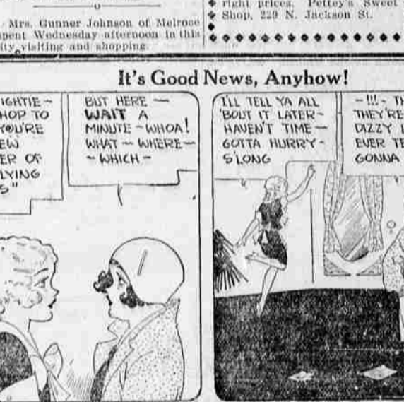
ALL RIGHTIE—THEN HOP TO IT—YOU'RE TH' NEW SKIPPER OF TH' FLYING BOOTS!