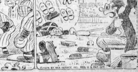
I WAS ALWAYS TAUGHT NOT TA TOUCH A THING THAT DOESN'T BELONG TA ME