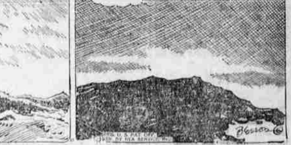
THE RADIO HAS SUDDENLY GONE BAD—I'M AFRAID WE HAVE A BIG JOB ON OUR HANDS! RADIO GONE BAD! THAT IS BAD NEWS—AND NIGHT UPON US!!