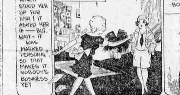
RECEIVED A MYSTERIOUS LETTER WHICH STOOD HER UP FOR FAIR! IT ASKED HER IF—BUT, WAIT—IT WAS MARKED "PERSONAL" SO THAT MAKES IT NOBODY'S BUSINESS YET