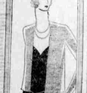
THE "COCKTAIL JACKET" has gained the recognition of a very popular vogue this season. This one of bronze sequin accompanies a brown velvet frock.