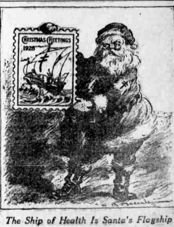
The Ship of Health Is Santa's Flagship