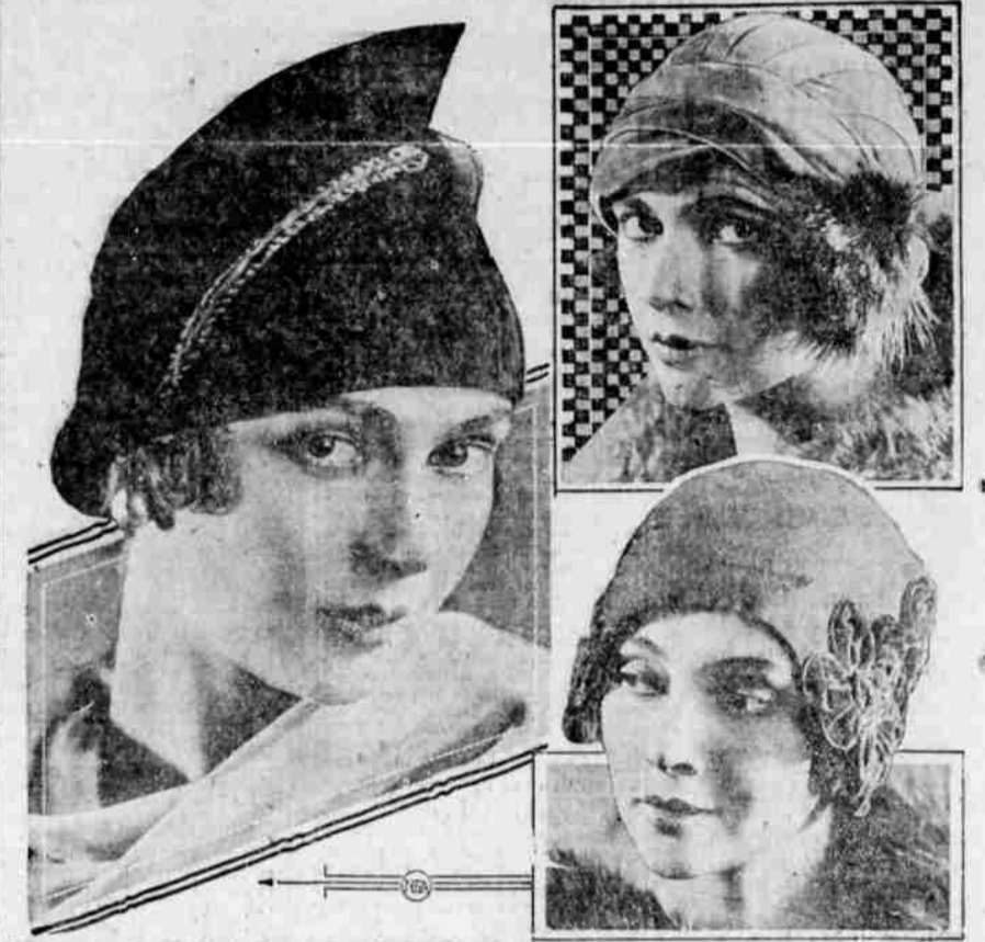
A Reboux turban of black velour has a flame and jade silk ornament. (Above) Grey and green velvet stripe a smart turban and the algrete repeats the colors. (Below) The back of a sweet little brown turban is a garden of velvet flowers in nasturtium colors.

A second way to meet this problem is shown in a little Florence Walton draped turban in green and turquoise velvet. This is a be-