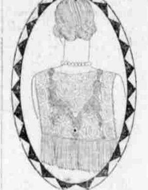
A NEW VERSION of the sailor collar, of lace with a pleated border, ties in front with a bow.