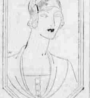
A CHIC AND PRACTICAL sports bandeau for securely growing hair is of colored taffeta with an adjustable gilt buckle.