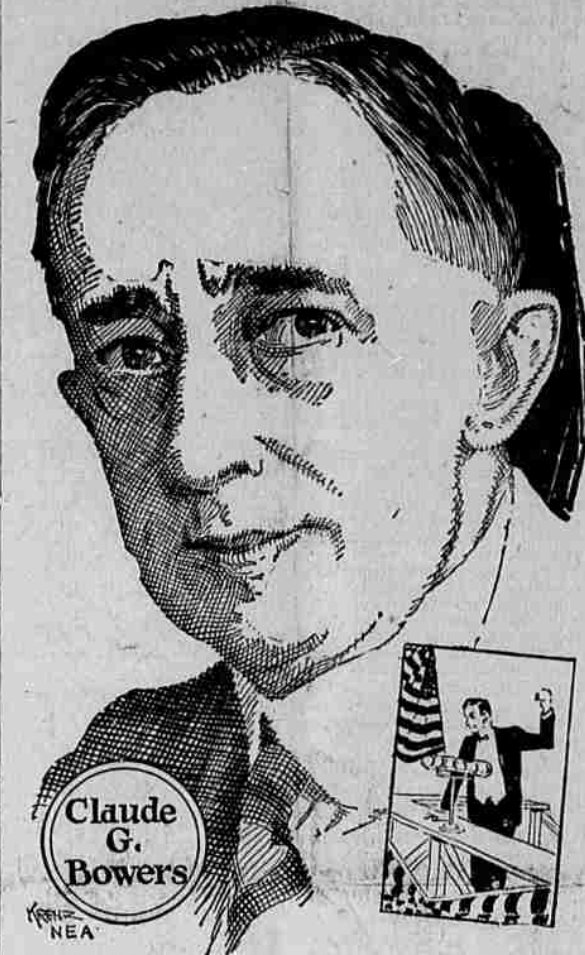
Claude G. Bowers. Noted, was while he was still in high school; and before his graduation he had given promise of his future ability as a speaker by winning a state medal for oratory. Defeated for Congress. On his graduation from high

school he went to Terre Haute and became a reporter for the Star. While there he exercised the Hoosier's privilege of becoming active in politics, and in 1904 he ran for congress under the approval of John E. Lamb, then a dem-