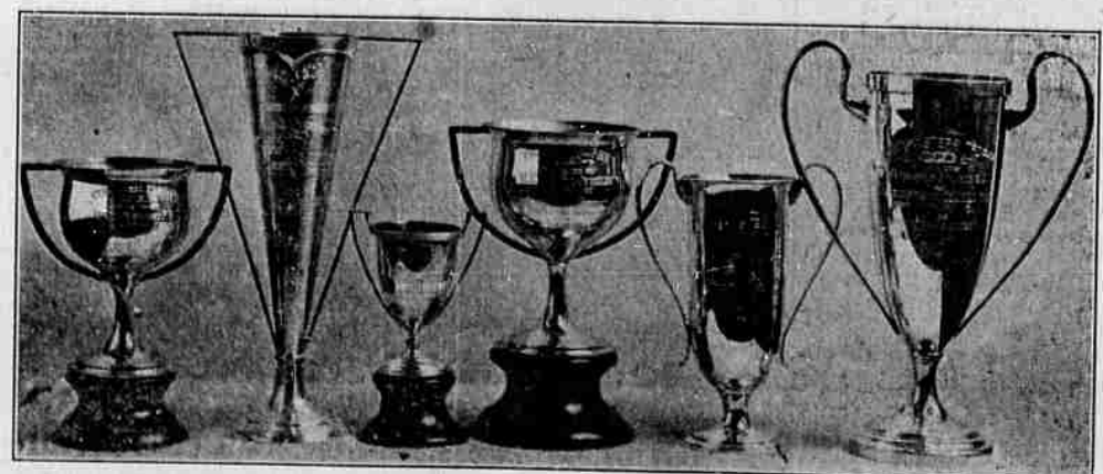
Some of the trophy cups to be competed for in the Grand Parade, Wednesday, 3:00 P. M.