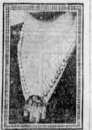
New jewelry sounds a primitive note in its colorful, massive fashioning. Jade, inlaid with enamel in an architectural design, forms this pendant, the focal point on a dinner gown.