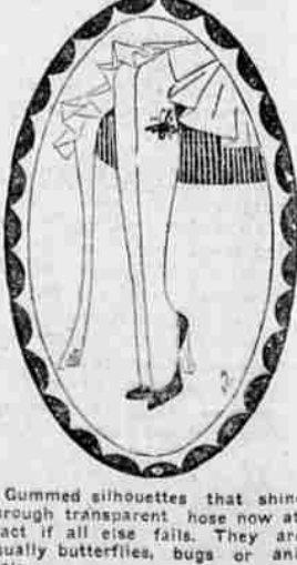
Gummed silhouettes that shine through transparent hose now attract if all else fails. They are usually butterflies, bugs or animals.