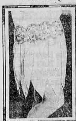
A dawn pink Paris evening slip has a hip yoke of rich cream lace and the skirt portion a dozen separate delicate pink petals that allow great freedom for dancing.