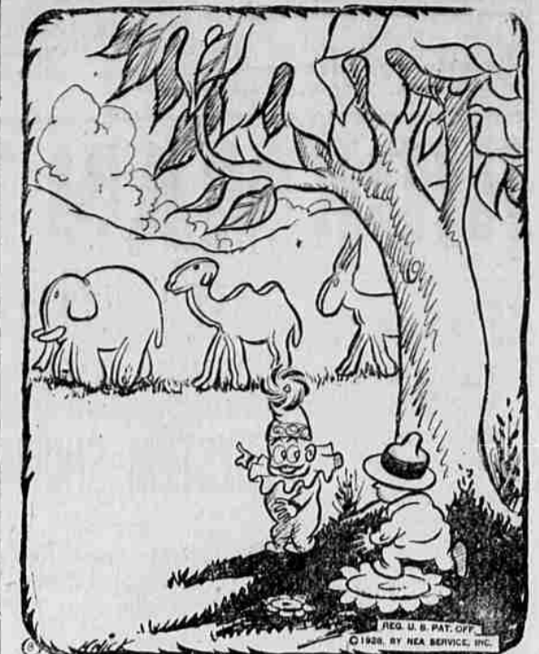
READ THE STORY, THEN COLOR THE PICTURE. (The Tinymites build an animal barn in the next story.)

The Tines now felt very bold, and so they did as they were told. A lot of animal crackers formed into a neat, long line. "All ready!"