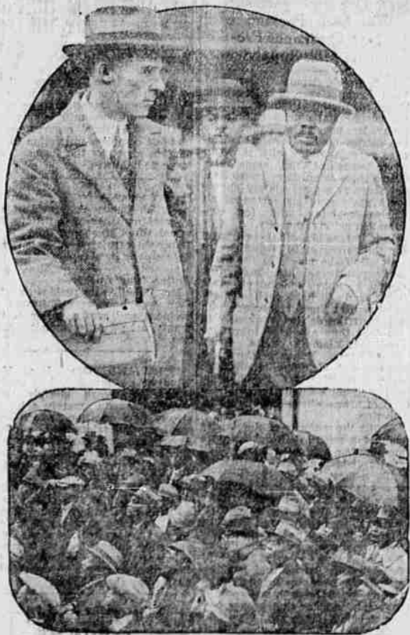
Released from Atlanta penitentiary after serving a year's sentence on conviction for fraud, now deported to Jamaica, Marcus Garvey, self-styled president general of Africa, is shown above as he was leaving United States shores at New Orleans. A throng of Garvey's admirers gathered in the rain to hear his farewell speech. Garvey headed the Universal Negro Improvement Association, and his dream was an African Utopia.