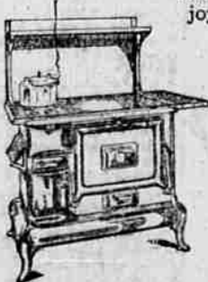
Colonial Range; all porcelain enamel in white, gray or Santone. Buffet shelf, 18-inch oven.