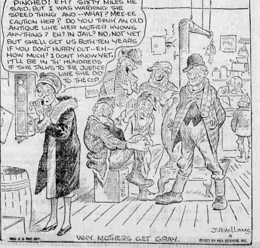
WHY MOTHERS GET GRAY. (Copyright, 1927, NEA Service, Inc.)