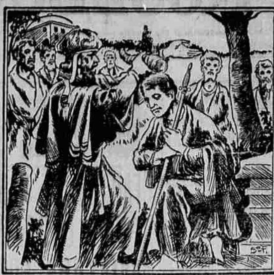
Text: 1 Samuel 16:4-13.