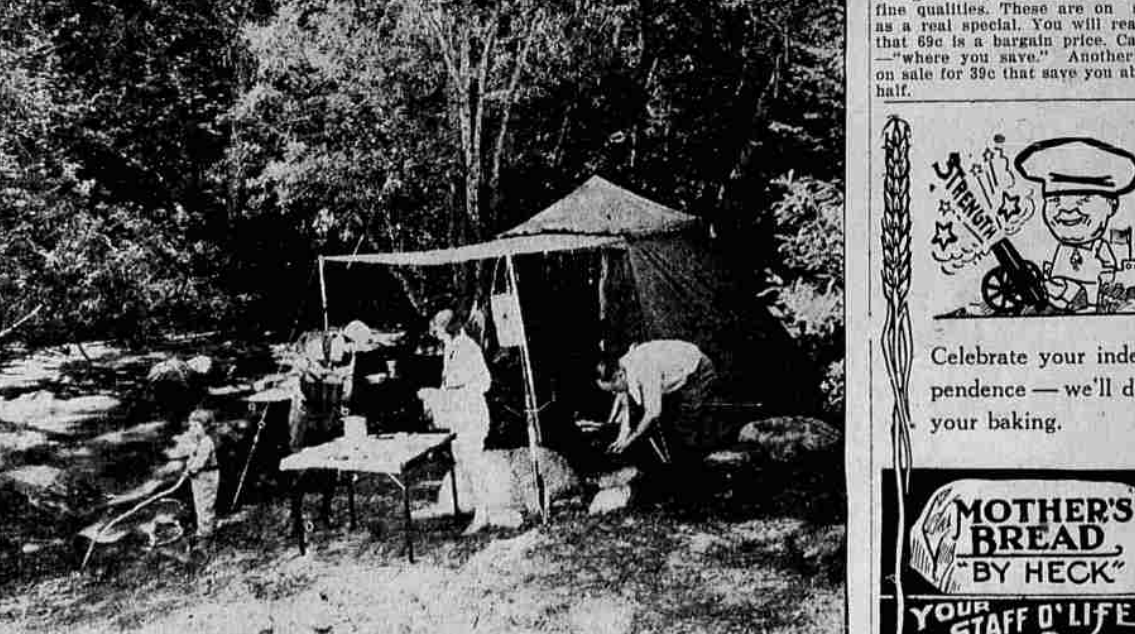
Fish are bitin'. The old Call of the Open Road is working overtime and all roads lead to the mountains. The tent and camp outfit in the above picture from the Western Auto Supply Company makes you want to get right in and enjoy the fun that goes with motor camping. Many additions to camp comfort and convenience are offered this year by the Western Auto stores.