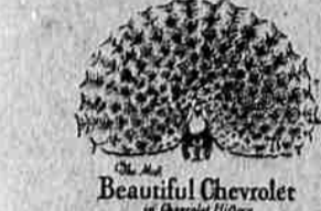
Beautiful Chevrolet at Chevrolet History