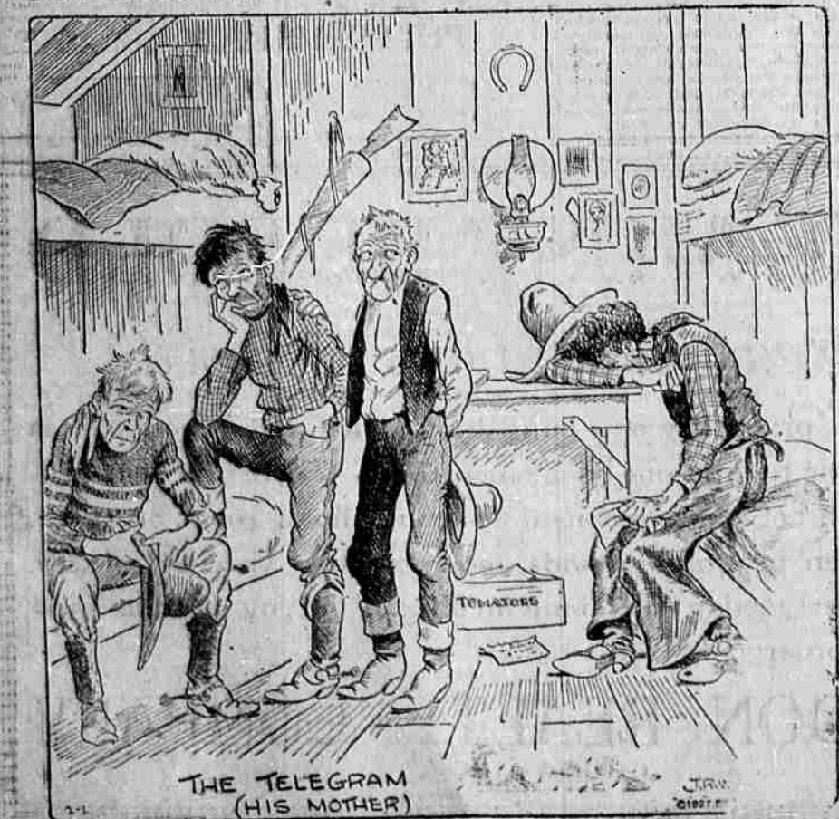
THE TELEGRAM (HIS MOTHER)