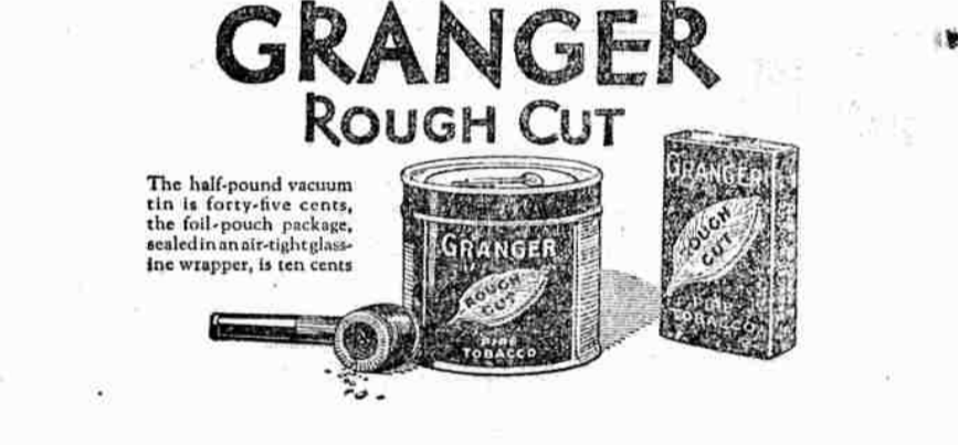
Granger Rough Cut is made by the Liggett & Myers Tobacco Company

Cool. . . spicy. . . mild. . . and mellow! A couple of pipe-loads settle your tobacco problem forever! You'll settle down to Granger. . . for the rest of your life!