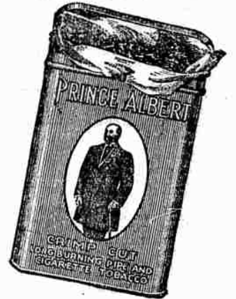
P. A. is sold everywhere in tidy tins, pound and half-pound tin humidors, and pound crystal glass humidors with sponge-moistener top. And always with every bit of bite and punch removed by the Prince Albert process.

Maybe you think you are all set in the matter of smokings. I wouldn't stop there. Because, if you haven't smoked P. A., your best bet is still to be collected. On my say-so, and that of millions like me, why don't you try Prince Albert? I'll guarantee you'll be glad you did.