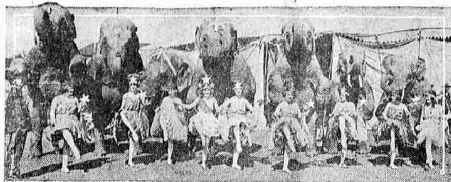
GROUP OF CALIFORNIA BEAUTIES TO BE SEEN WITH CIRCUS

The A. G. Barnes circus, which grows larger and more gorgeous each year, has provided for lovers of magnificent pageants this season the American giantess, historic feature, "Pocahontas at the Court of Queen Anne," the extravaganza that opens the big program in which 2000 wild educated animals from every clime under the sun is represented in daring and thrilling acts.