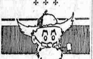
Late Perkins sez: "I'd walk a mile to see a camel."

Just before noon we walked over to the circus grounds and imbibed some pink punch and it's a good thing the Umpqua water was gr. tastin' in the first place.