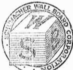
Fig. U. S. Pat. Off. This trade-mark on every sheet for your protection.

Get Schumacher Plaster Wall Board from your lumber dealer. Ask him about this short cut to fine, permanent walls.