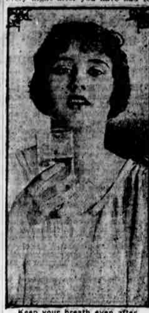
Keep your breath even after smoking

your circulation. Massage your scalp and shake out your hair—so the scalp gets a chance to be well aired—for at least a half hour every night after you have had to