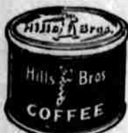
In the original Vacuum Pack which keeps the coffee fresh.