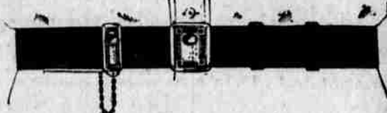
Makes a Great Gift $1.39