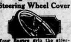
Steering Wheel Cover

Repairs leaky radiators, cracked cylinders and water jackets. Offered this week at the reduced price of 62c