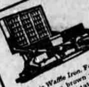
Electric Waffle Iron. For delicious, crispy brown waffles. Makes straight-ahead fluff. Mother can straighten the fluff and yet keep the plates fluffed.