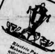
Electric Percolator. Makes coffee better and quicker. Anybody who drinks coffee will appreciate one.