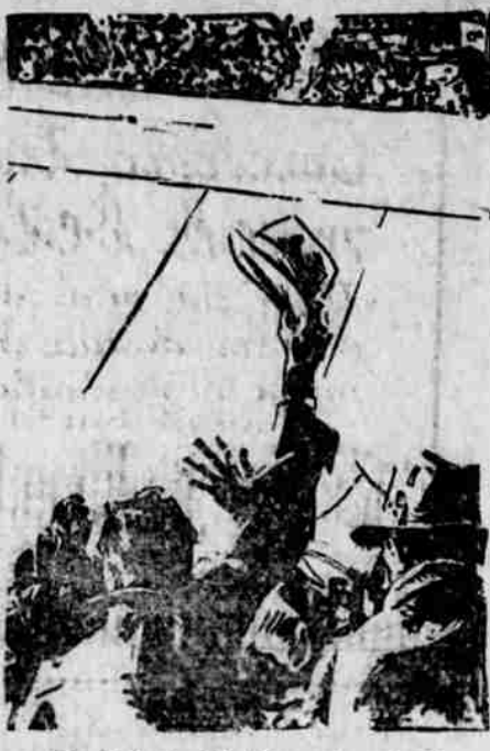
Our highest wish, if you do not yet know Camel quality, is that you try them. We invite you to compare Camels with any cigarette made at any price. R. J. Reynolds Tobacco Co.

The ladies of the Baptist church will have for sale all chicken hot tamales and candy next Saturday, Nov. 21st, at McKean, Darby & Baldwin's. Will take orders and deliver. Phone 10 or 354-Y.