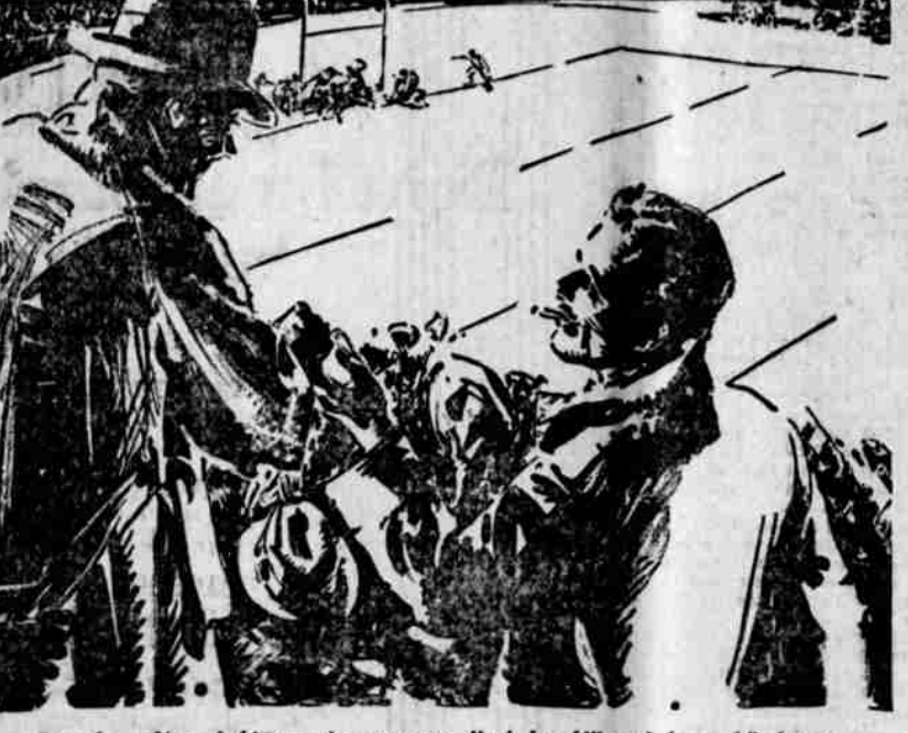
Into the making of this one cigarette goes all of the ability of the world's largest organization of expert tobacco men. Nothing is too good for Camels. The choicest Turkish and domestic tobaccos. The most skillful blenders. The most scientific package. No other cigarette made is like Camels. No finer cigarette can be made. Camels are the overwhelming choice of experienced smokers.