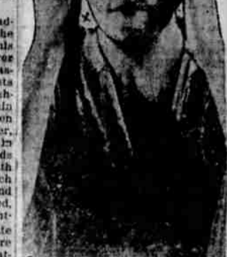
Tired eyes make the face old

Mattie—I think in your case the electric needle would be advisable for removing all the coarser hairs, and then continue to bleach the