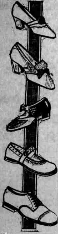
Table Displays $1.00, $2.85

The values in this sale cannot be realized until after months of wear. They are the John Kelly, Buster Brown, Boyd-Welch shoes that have set the styles of the shoe standards in Roseburg for years. We know you won't believe it until you see!