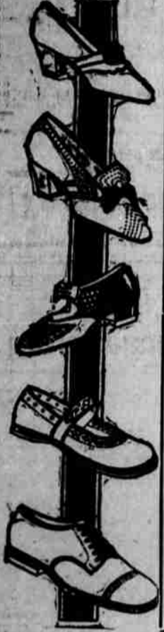
Table Displays $1.00, $2.85

The values in this sale cannot be realized until after months of wear. They are the John Kelly, Buster Brown, Boyd-Welch shoes that have set the styles of the shoe standards in Roseburg for years. We know you won't believe it until you see!