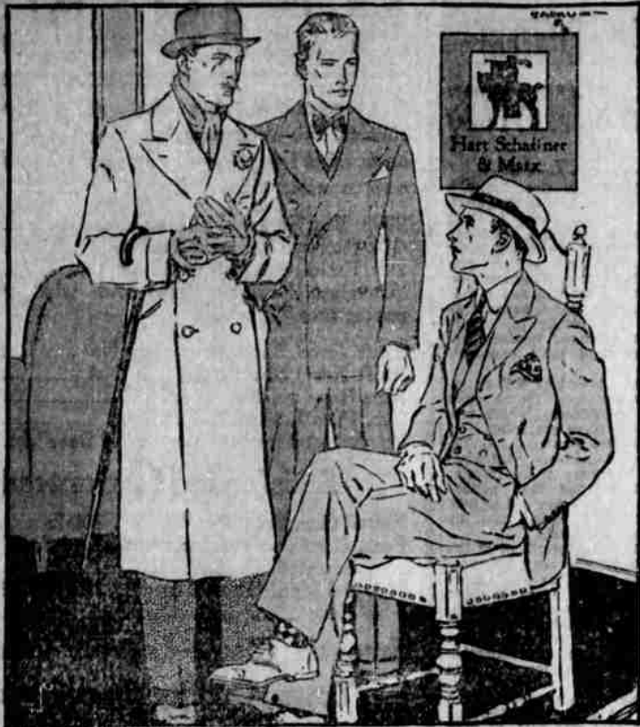
Copyright 1925 Hart Schaffner & Marx