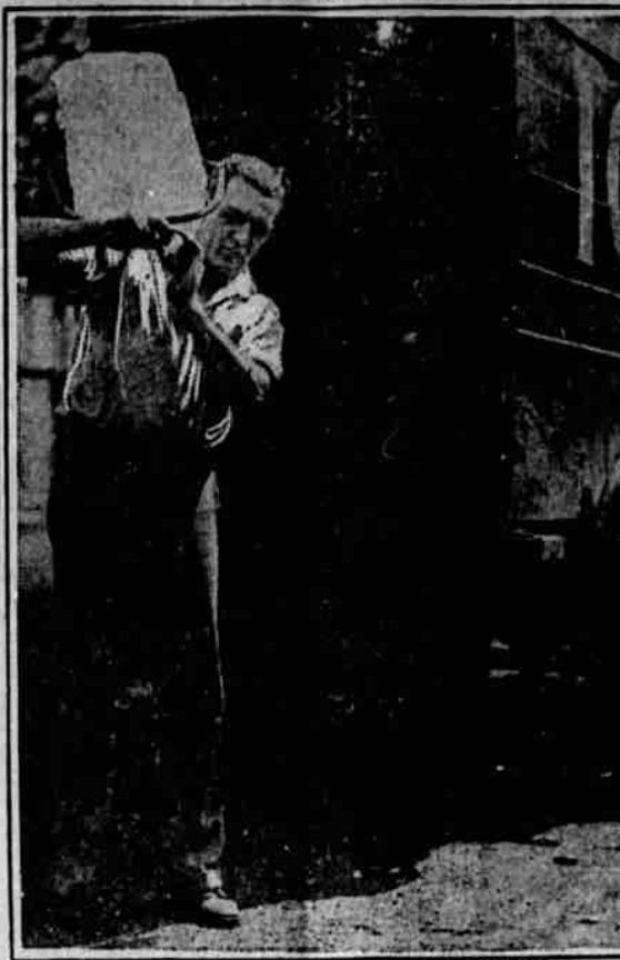
Harold "Red" Grange, All-American football hero of the University of Illinois, is keeping in trim for further exploits on the gridiron as an ice man in Wheaton, Ill., his home town. He rejected numerous attractive offers from movie producers, real estate and insurance firms, etc., in favor of this job, which he has held during several vacations.