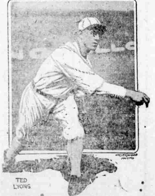
Baseball men generally are agreed that Ted Lyons, young hurler with the White Sox, is destined to take his place among the star hurlers of the majors in a year or two. Right now he is pitching stellar ball and by next year may be the club's main hurler.