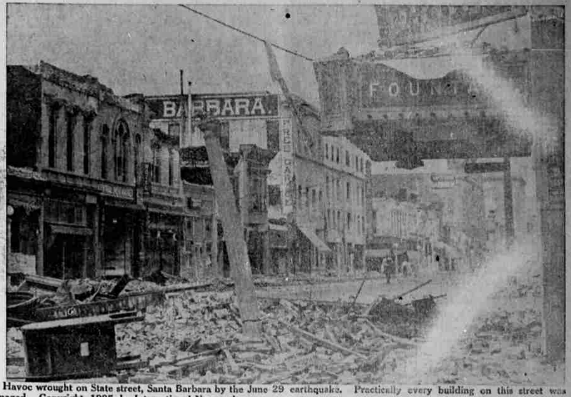
Havoc wrought on State street, Santa Barbara by the June 29 earthquake. Practically every building on this street was damaged.