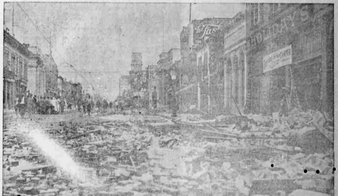
Ruins of Santa Barbara Earthquake. First picture of State street after Tremblor.