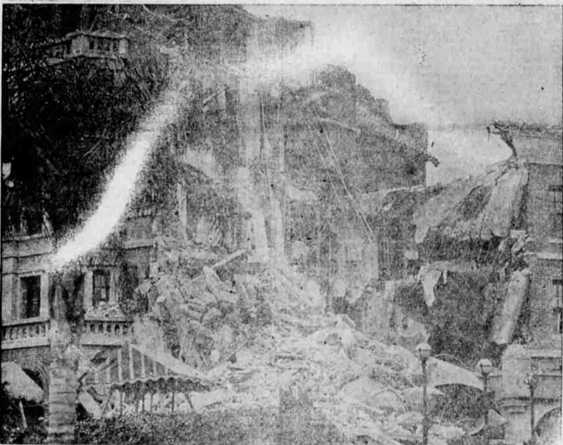
Hotel Arlington, famous Santa Barbara Hostelry, known to wealthy tourists throughout the world, after the June 29 earthquake.