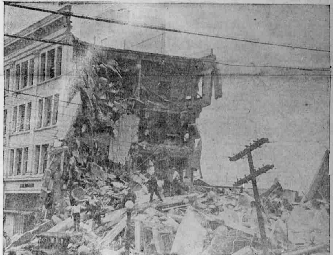
What was left of the San Marcos Building, the largest business structure in Santa Barbara after the earthquake of June 29.