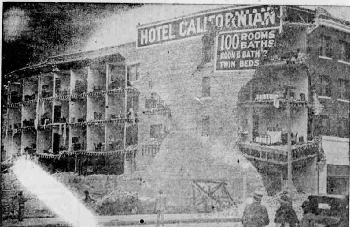
Californian Hotel after Santa Barbara Earthquake, which was the severest earth disturbance on Pacific Coast since 1906 disaster in San Francisco.