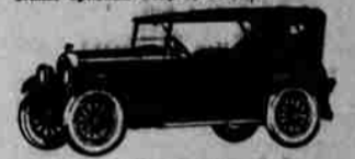
Touring Car $895 F. O. B. Detroit, tax extra. Four-wheel hydraulic brakes optional.