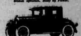
Club Coupe $995 F. O. B. Detroit, tax extra. Four-wheel hydraulic brakes optional. Body by Fisher.

Walter P. Chrysler's full conception of what a four-cylinder car should be has now become a reality.