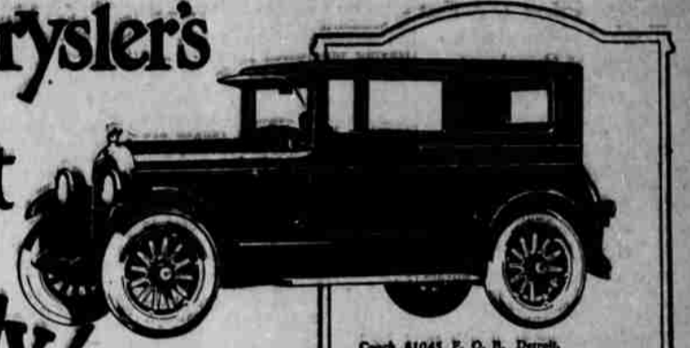
Coach $1045 F. O. B. Detroit, tax extra. Four-wheel hydraulic brakes optional. Body by Fisher.