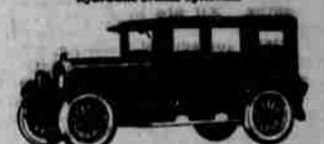
Sedan $1095 F. O. B. Detroit, tax extra. Four-wheel hydraulic brakes optional. Body by Fisher.