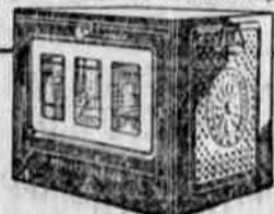
For abundant hot water without gas—the Perfection Reversible Water Heater.