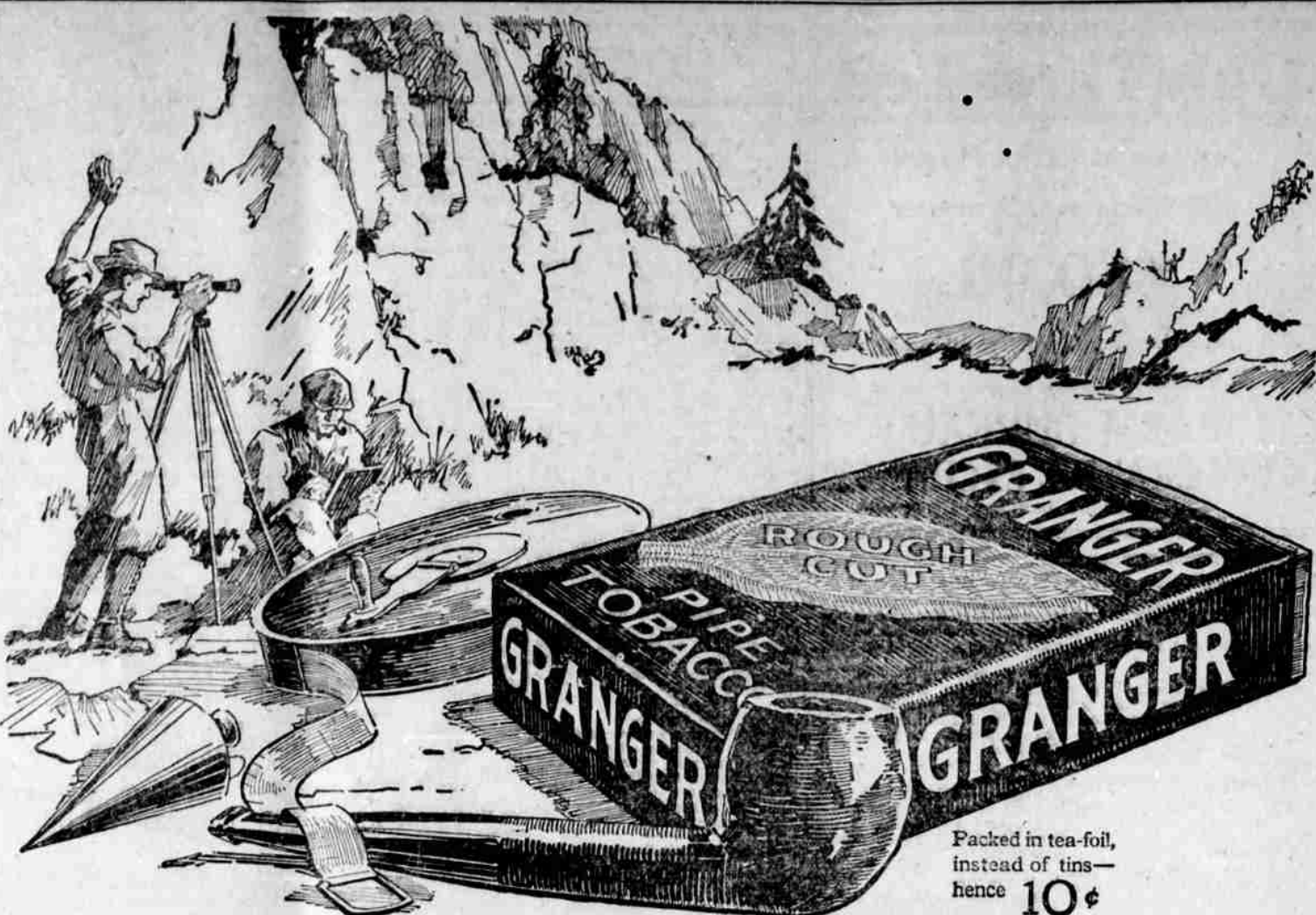
Packed in tea-foil, instead of tins—hence 10¢

A civic good turn found at $75,000 has recently been performed by the Boy Scouts in the interior of their state. A traffic cone was made simultaneously by the scouts throughout Ohio of paper, wire, trucks, buses and horse-drawn vehicles. According to the Division of Highways, the survey would have cost the state the for-