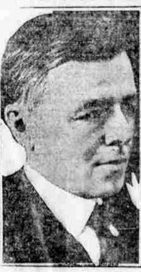
Judge Lafon Allen of Louisville, Ky., is being considered by White House for the post of attorney-general of the U. S.