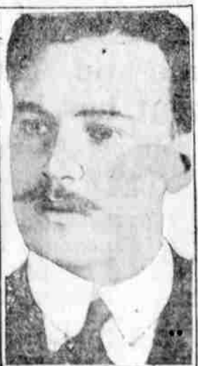
Appointment of Rt. Hon. Sir George Lloyd, former governor of Bombay, as British high commissioner in Egypt, appears to be meeting with approval along the Nile. He succeeds Field Marshal Viscount Allenby.