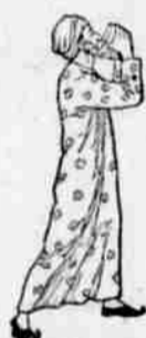
Reg. U. S. Pat. Off.