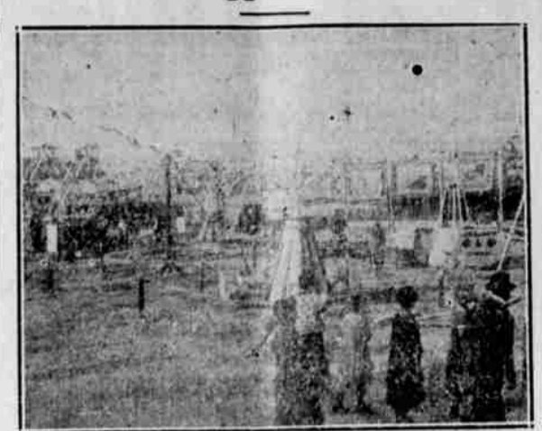
A General View of the Kiddies' Play ground, which will be a feature of the Joy Zone at Roseburg Strawberry Carnival.

Every community can not be a center for a world's fair, yet "be there a town with spirit so dead" that it does not aspire to a rousing local celebration at least once a year?