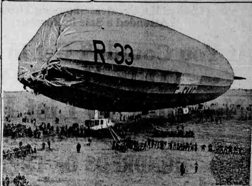
IN THE REPAIR SHOP —The British R-33, which, like the American dirigible Shenandoah, broke from its moorings in a gale and was swept out to sea, is seen in the condition in which it returned from its perilous trip, twenty-eight hours later. It will be some months before it will fly again.