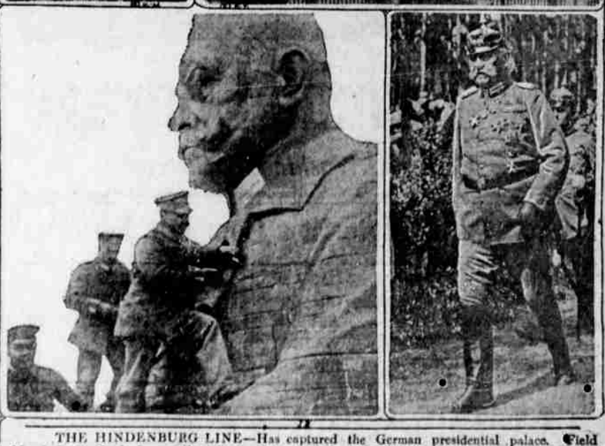
THE HINDENBURG LINE —Has captured the German presidential palace. Field Marshal von Hindenburg will now occupy the magnificent Berlin palace of his former royal master, Emperor William, shown above. He is seen above in military and civil raiment. Also shown is the famous wood statue of Hindenburg.