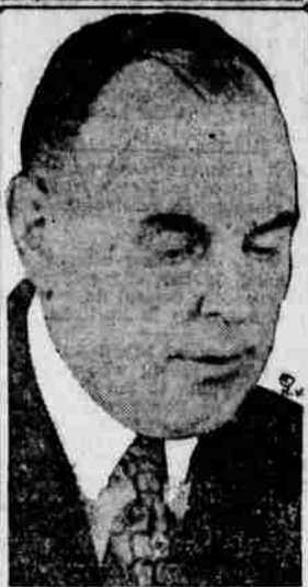
COMMANDER-IN-CHIEF —Of the new unified border patrol, organized to war on both liquor and alien smugglers, is W. W. Husband, commissioner of immigration.