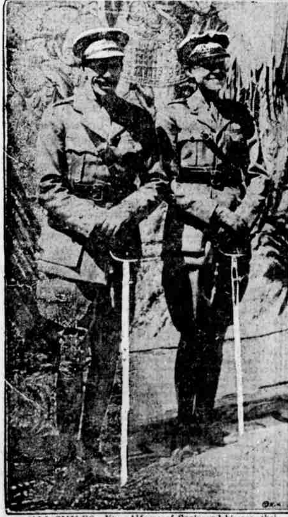
ALL SMILES —King Alfonso of Spain and his son, the crown prince of the Asturias (crown prince) seem very much pleased with the showing of the Spanish troops in the military parade.