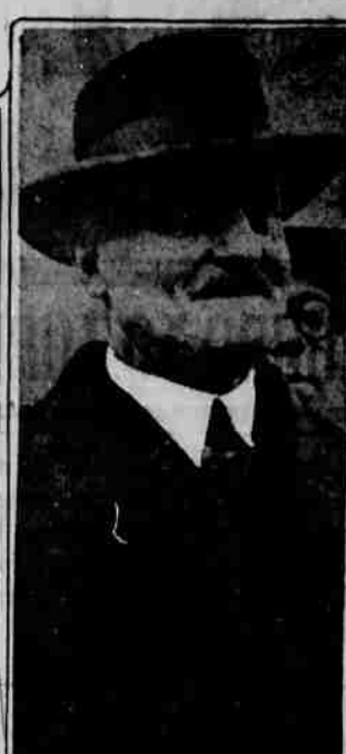
TWIN ATLAS —All of France's mountainous troubles are resting insecurely on the shoulders of Paul Painleve, premier, and Joseph Caillaux, ex-chiefe and finance minister. Caillaux (above) and Painleve (right) are seen arriving at the presidential palace.