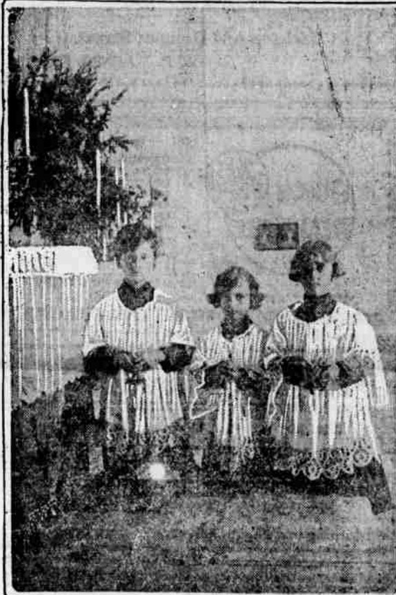
UNCROWNED "KING" —The Archduke Otto (left), heir to the "thrones" of Austria and Hungary, seen with his brothers, Felix and Robert, at their private altar in their home in Spain.