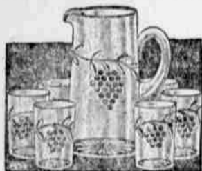
PITCHER AND SIX GLASSES

Beautiful cut grape design, clear crystal glassware, deeply cut. This is a remarkable bargain and will sell out quickly. Come early and take advantage of this sale.