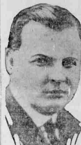
D. C. STEPHENSON