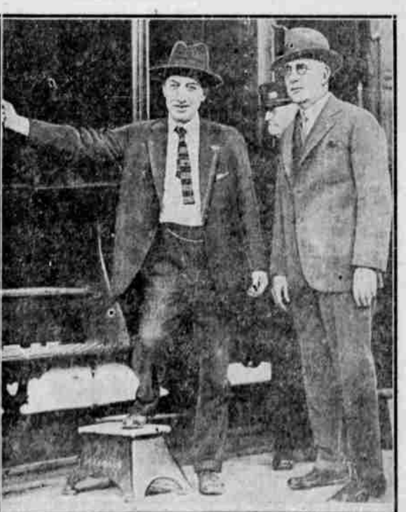
DR. FREDERICK COOK (left) ON WAY TO PRISON

Dr. Frederick Cook (left), who gained fame as the self-called "discoverer" of the North Pole, is shown being transferred from the county jail at Fort Worth, Texas, to the Federal prison at Leavenworth, Kansas, to serve a long term following his conviction of fraudulent usage of the mails in an oil scheme. He entered the Leavenworth prison on the anniversary of the day Admiral Peary actually discovered the pole.