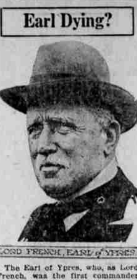
The Earl of Ypres, who, as Lord French, was the first commander of the British Expeditionary Forces in France during the World War, is reported in a grave condition as a result of an operation in a London hospital.

logging machinery, equipment and supplies will be exhibited, he said.