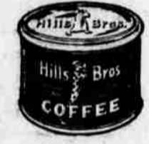
In the original Vacuum Pack which keeps the coffee fresh.